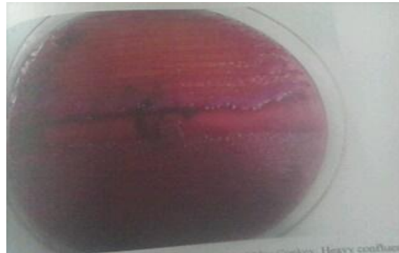
Plate 1. Preliminary macroscopic morphology of Klebsiella species on McConkey agar

suggests that Klebsiella species is one of the aetiologic agents of urinary tract infection among the set of people screened during the time of this study.