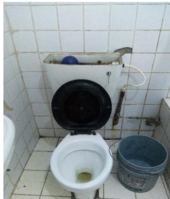
Plate 4. The waterlines public toilet