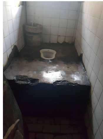
Plate 2. The mile 3 public toilet