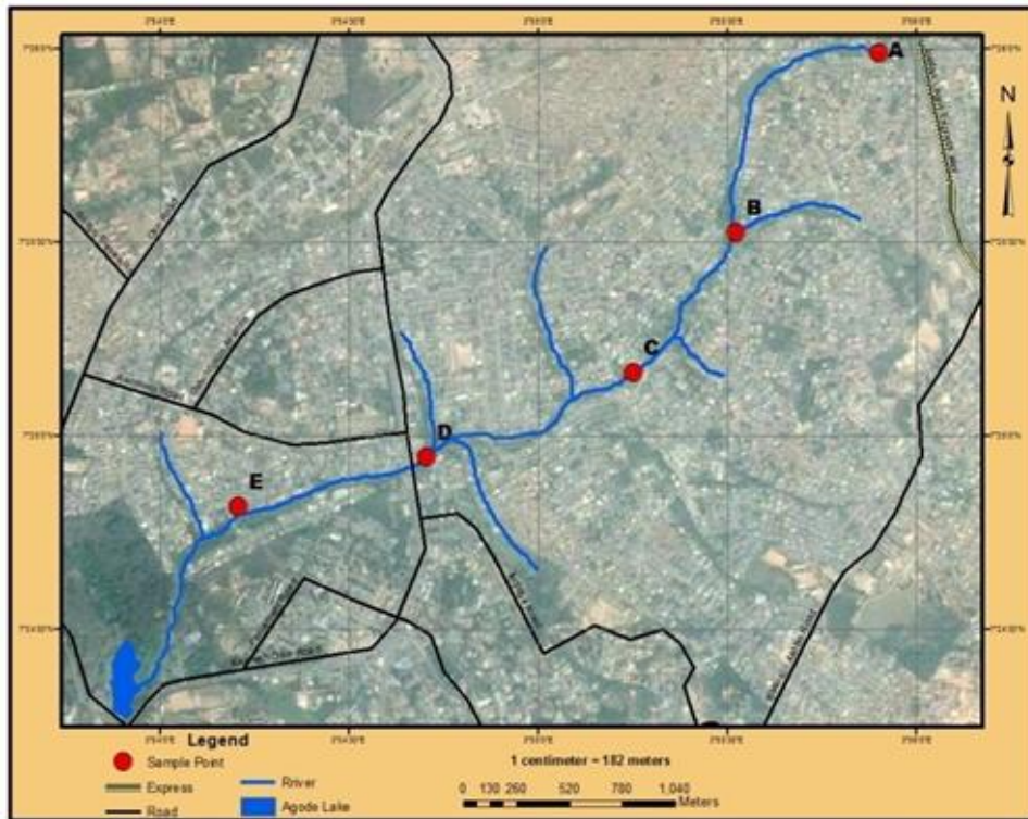
Plate 1. Sampling locations A, B, C, D and E in Ogunpa River