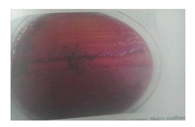
Plate 1. Preliminary macroscopic morphology of Klebsiella species on McConkey agar

suggests that Klebsiella species is one of the aetiologic agents of urinary tract infection among the set of people screened during the time of this study.