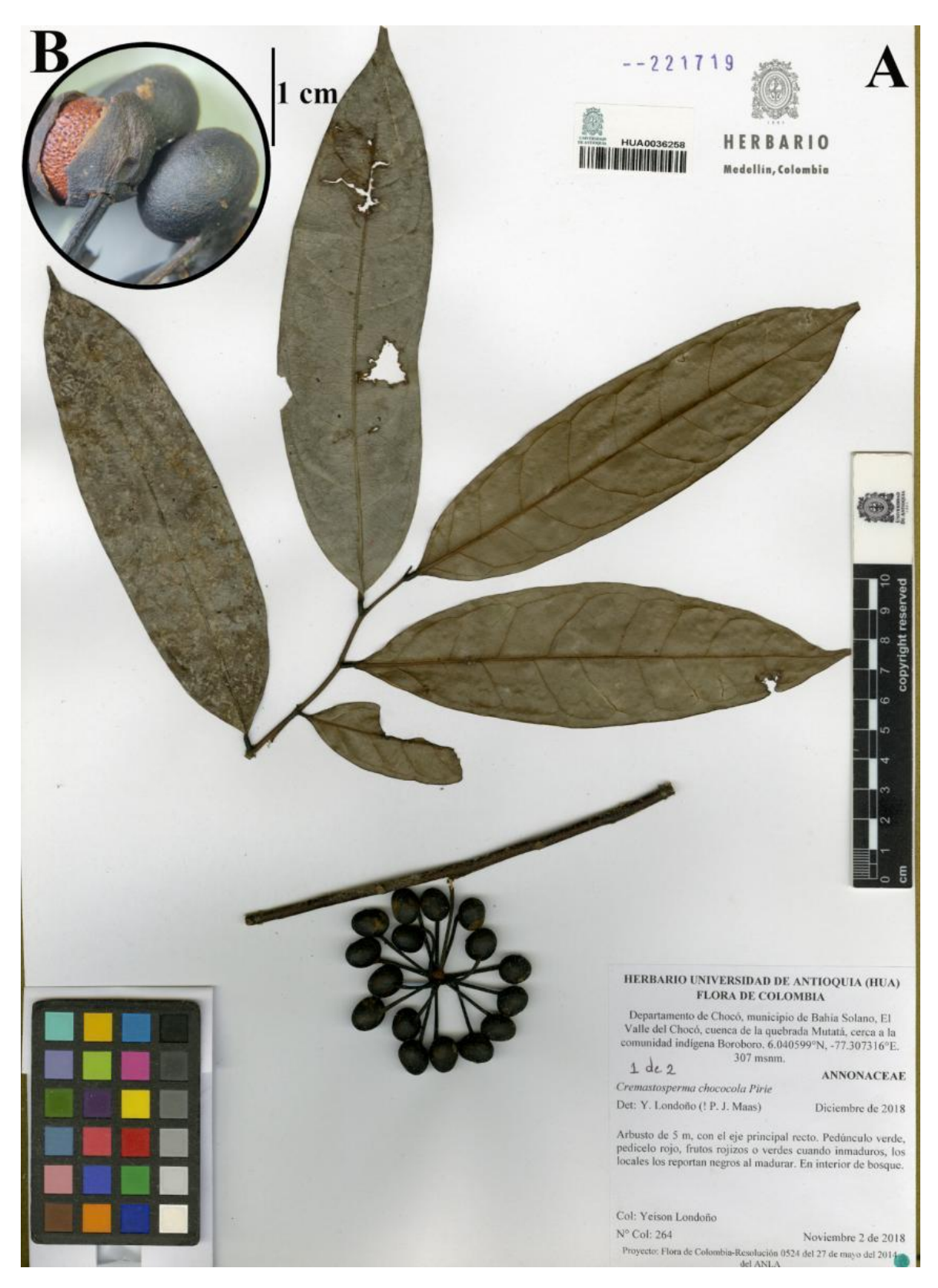
Fig. 7. Digital plate of Cremastosperma chococola . A) specimen at HUA. B) monocarps and seed surfaces. A from Y. Londoño 264 (HUA accession 221719 [!]); B from Y. Londoño 264 (HUA accession 221720 [!]). Digital plate by Y. Londoño