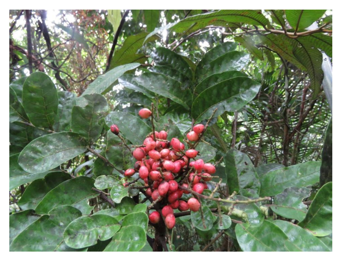
Fig. 2. Live photograph of Mosquitoxylum jamaicense from the chocó department in Colombia, showing a fruiting branchlet. Photograph from Y. Londoño 257 (HUA accession 221807 [!]).

acroscopic side with 3-6 glands between the margin and midvein; midvein and secondary veins raised abaxially, slightly less so adaxially. Racemes axillary or ramiflorous. Flowers unknown. Fruits up to 4.7 cm diam., surface of valves rugulose, globose, indehiscent, 1-seeded [18].