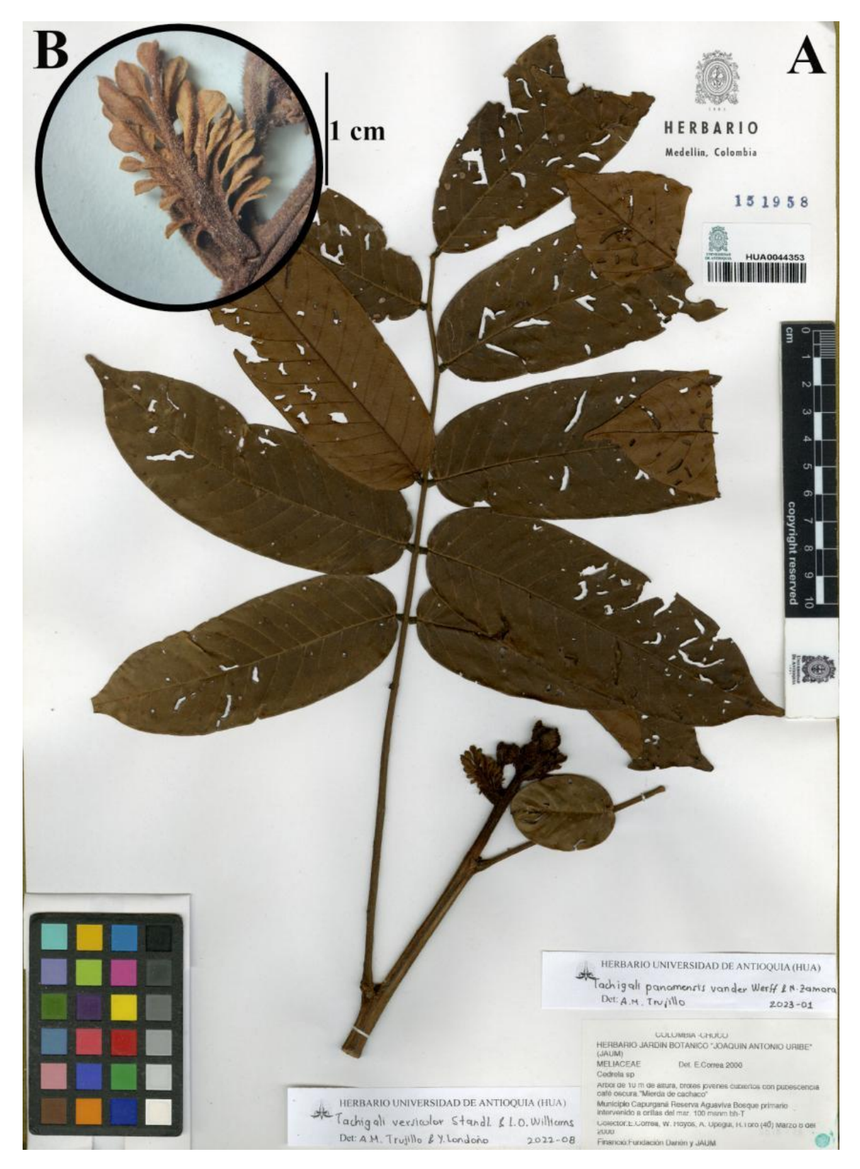
Fig. 5. Digital plate of Tachigali panamensis . A) specimen at HUA. B) detail of stipule. A-B from E. Correa et al. 40 ( HUA accession 151958 [!]). Digital plate by Y. Londoño