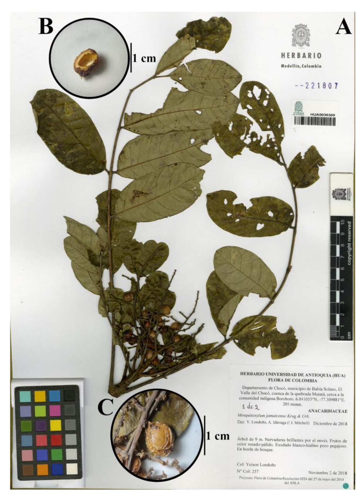
Fig. 1. Digital plate of Mosquitoxylum jamaicense . A) specimen at HUA. B) fruit manually open, showing locule mainly empty. C) fruit, showing outer surface. A-C from Y. Londoño 257 (HUA accession 221807 [!]). Digital plate by Y. Londoño