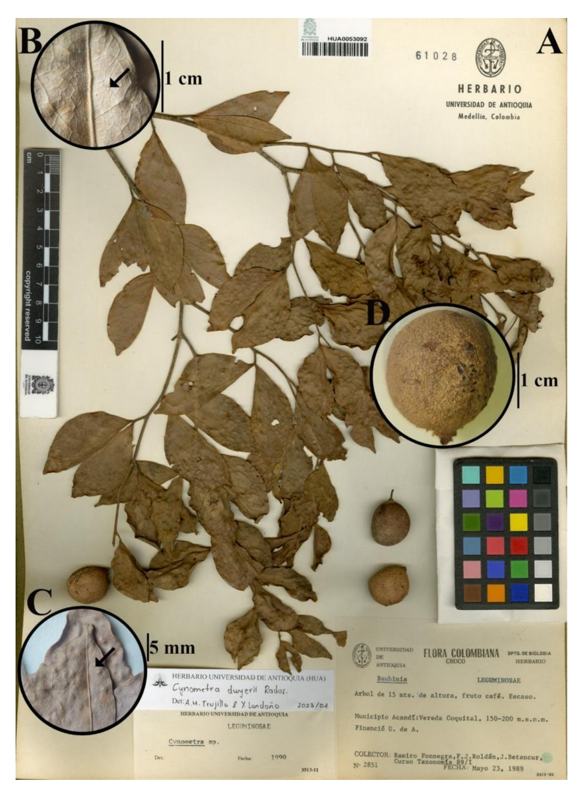
Fig. 4. Digital plate of Cynometra dwyerii . A) specimen at HUA. B) detail of leaflet at abaxial surface, showing laminar glands and indumentum, arrow indicating a gland. C) detail of leaflet at abaxial surface, showing distribution of laminar glands on the leaflet upper half, arrow indicating a gland. D) fruit, outer surface. A-D from R. Fonnegra et al. 2851 (HUA accession 61028 [!]). Digital plate by Y. Londoño