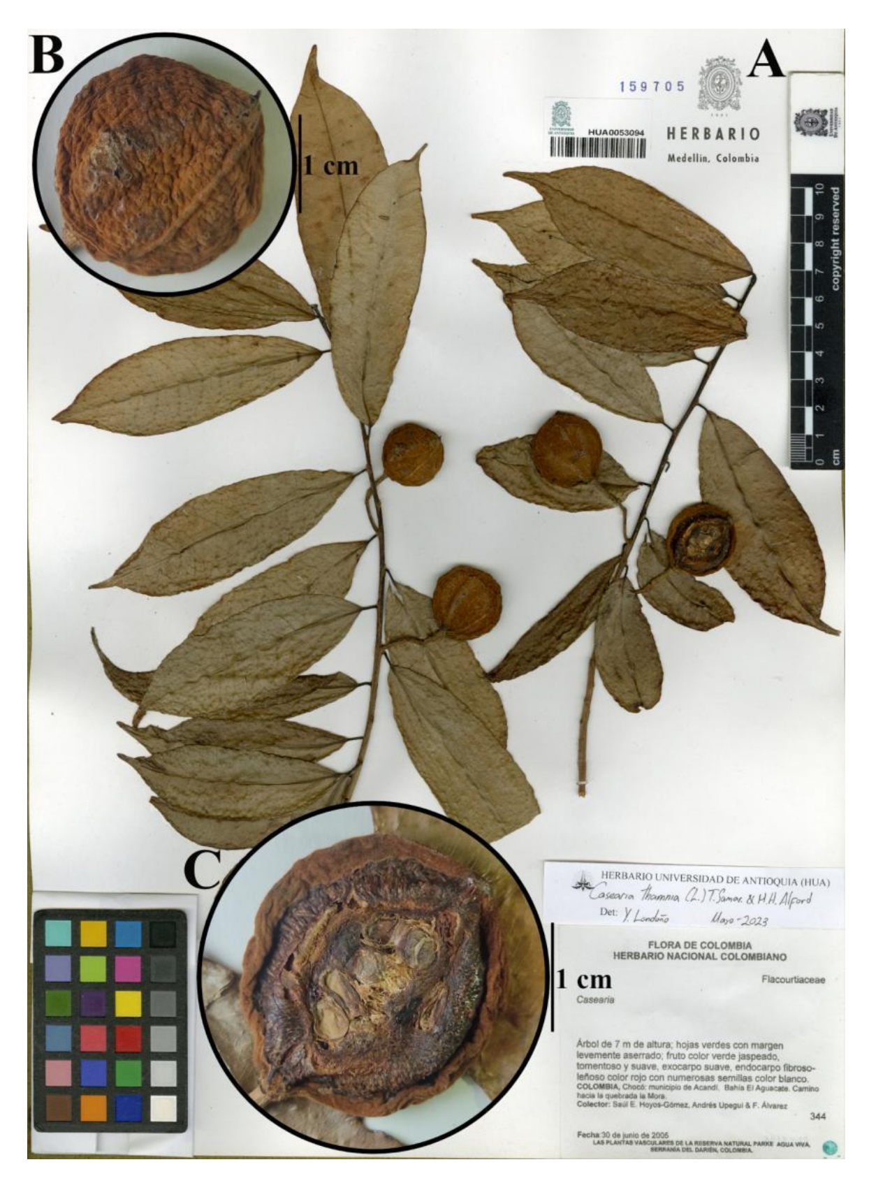
Fig. 8. Digital plate of Casearia thamnia . A) specimen at HUA. B) fruit, outer surface. C) fruit, longitudinally and manually open. A-C from S. E. Hoyos-Gómez et al. 344 (HUA accession 159705 [!]). Digital plate by Y. Londoño