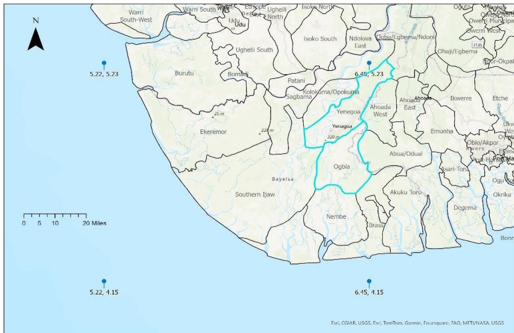
Fig. 1. A Map showing pipeline right of way in Yenagoa and Ogbia Local government area

The biodiversity indices calculated for the grass species in the two sampling points are presented in Table 2. The Simpson index values (0.023 and 0.026) and the Shannon-Wiener index values (3.953 and 3.346) recorded in Ogbia and Yenagoa sites, respectively, suggest high species diversity and that no species has an absolute relative abundance, indicating a more balanced community. The evenness index values (0.003 and 0.003) suggested that the site's grass structure was predominantly composed of a few dominant species. Margalef values (of 7.449 and 7.329) indicate that the two study sites have equally high levels of species richness, highlighting their potential as diverse grazing resources in these areas. Generally, the indices reveal that the two communities were complex, with a likelihood that many of the species interactions contribute to the ecosystem dynamic. Sixty-six of the species had a 99% occurrence on both sites, while eighteen had a \geq 50\% frequency index in Ogbia PROW study plot. And twenty-eight species had a \geq 50\% frequency of occurrence in Yenagoa PROW sites. It was also observed that all species were present in the sites year-round.