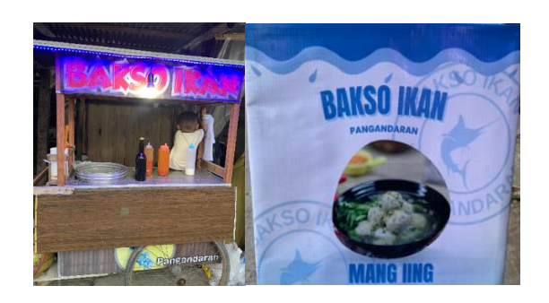
Fig. 1. Place selling Mang ling fish balls

Mang ling fish balls are a processed fishery product produced by MSMEs Mang ling. The production is located in Bojongjati RT 1 RW 4 Wonoharjo Village, District Pangandaran, Pangandaran Regency. This business has been started since 2006. The products are the result is fish meatballs in sauce. This business was founded on the basis of an idea that Mang ling had with see the fisheries potential in the Pangandaran area. The initial capital used is also pure personal savings without any cooperation with other parties.