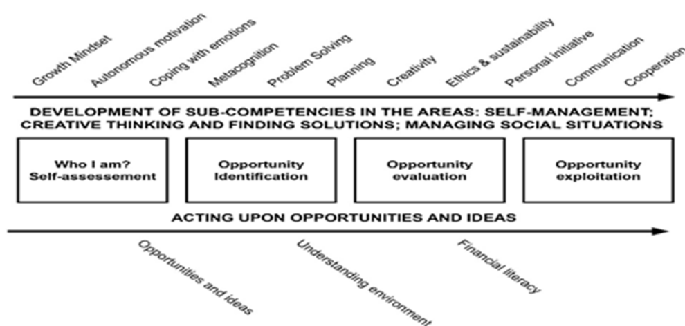
Figure 3. Development of sub-competences of entrepreneurship competence during the different stages of the entrepreneurial process. Source: created by the authors.

attention to the students' understanding of their mindset, motivation and attitude towards entrepreneurship and the activation of prior knowledge and skills. Then, at the stage of identifying the client's problem, the focus shifts to the thinking skills, including creativity, problem-solving, planning skills and ethical and sustainable thinking. At the stage of discovering business opportunities, it might be expedient to address in more depth the skills related to the initiation and handling of different types of social situations (e.g., tasks to develop initiative, communication and cooperation skills). This way, each stage of the learning process can be complemented by tasks supporting the development of sub-competencies, which are important to better act in the entrepreneurship process. Learners can test their competencies in the process of developing their business ideas through practical activities, which in turn will gradually increase the level of their entrepreneurship competence as a whole. This way, different aspects of personal development can be addressed at different stages, which influences the ability to regulate oneself in the process of implementing business ideas and allows achieving more reasoned decisions.